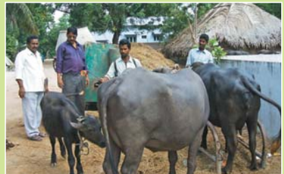
With a view to extend a helping hand to the badly hit Flood affected people of Kurnool, Guntur and Krishna districts of Andhra Pradesh and some parts of the Karnataka state, the management of Heritage Foods India limited (HFIL) and the employees working across Andhra Pradesh have contributed their respective one day gross salary and the Senior Management team including President, ED and VC-MD have contributed their one month salary towards the flood relief activities. Distribution of the relief kits and other relief material supplied to the beneficiaries, supply of feed and mineral mixture to the cattle and cattle camps as by Heritage.